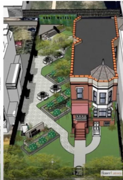
Muddy Waters House Museum Garden, 4339 S. Lake Park Ave. Rendering Credit: Bauer Latoza Studio