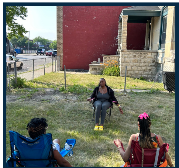
Muddy Waters MOJO Museum