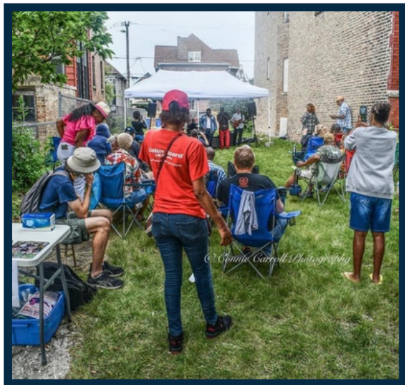
Muddy Waters MOJO Museum